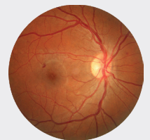
Optic disc, retina and blood vessels

AI promises to expand access to health care and make disease screening and diagnosis using Machine Learning (ML) and AI more affordable.